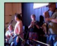
Market Street Moochers