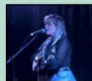
Blues Open Mic