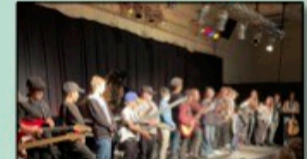
Hume Conservatorium showcase

Thursday and Friday events are free and tickets for Saturday and Sunday can be purchased online for $25 per day. For more information visit www.goulburnclub.com.au/bluesweekend Live music is our speciality at the Goulburn Club.